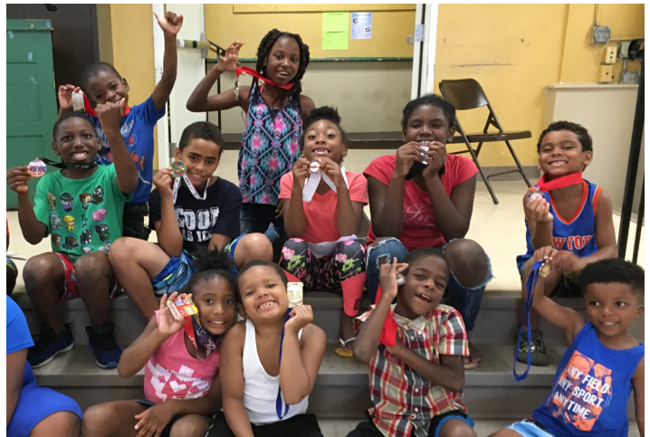
The Brogan Open Water Classic benefits the Malachi Center Urban Kids' Swim Camp. We are proud to be "Big Swimmers helping Little Swimmers."